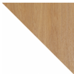
Lissa Oak with White