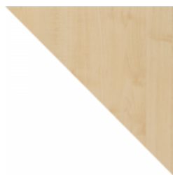
Maple with White