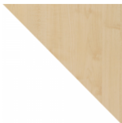
Maple with White Contrast