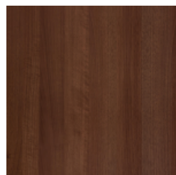
Opera Walnut (OW)