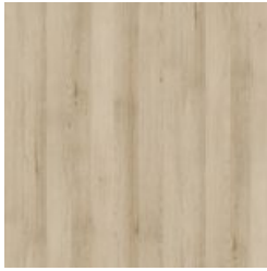
Sand Beech (SB)